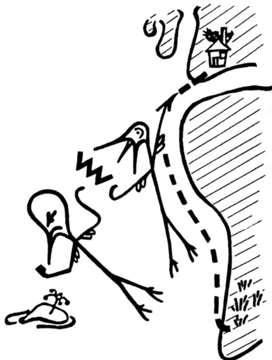
Drawing by Jeremy Griffith © 1991 Fedmex Pty Ltd

The following analogy serves to clarify what took place.