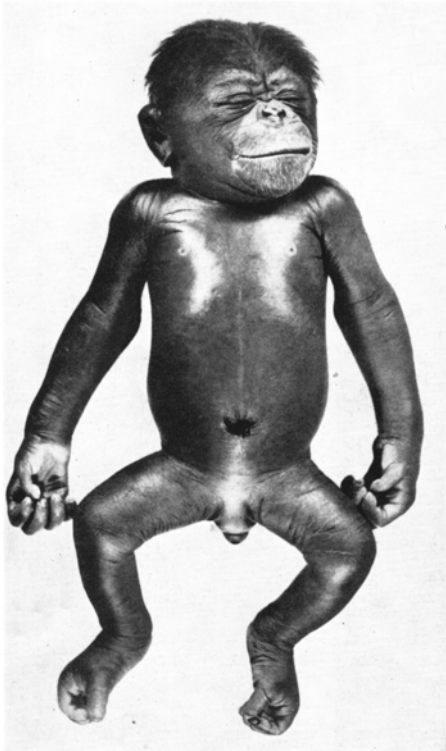
From The Life of Primates , Adolph H. Schultz, 1969

This photograph of a common chimpanzee foetus at seven months shows body hair on the scalp, eyebrows, borders of the eye lids, lips and chin, precisely those places where hair is retained in adult humans, again illustrating the influence of neoteny in human development. Clearly, humans are an extremely neotenised ape.