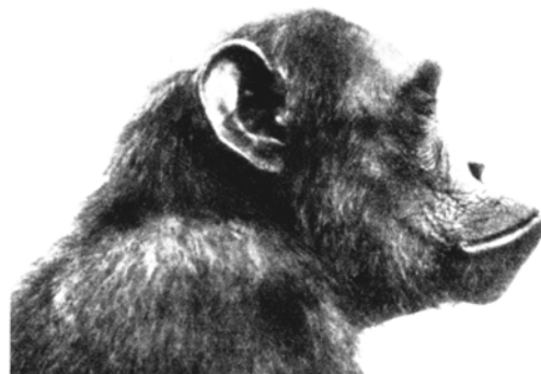
Photographs from The Mismeasure of Man , Stephen Jay Gould, 1981