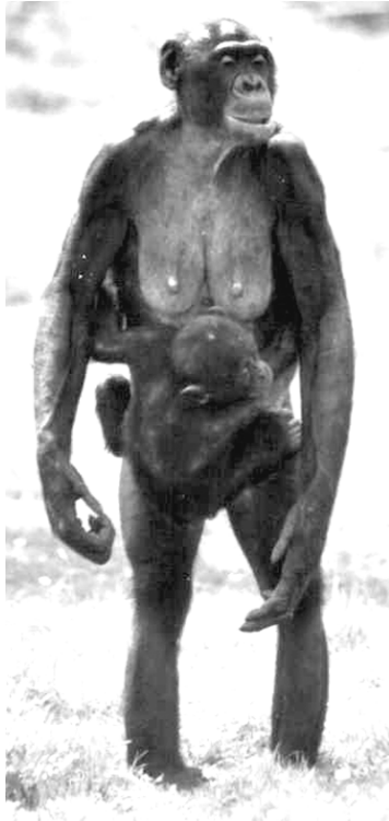
Bonobo female (with infant) showing large breasts. Wild Animal Park Planckendael ( www.planckendael.be )

jungle's canopy for sleeping, travelling and shelter. As a result, the social model of the bonobos is vastly different to that of the common chimpanzees.